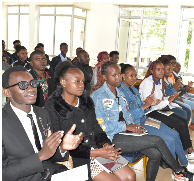
A section of the students following the proceedings at the Conference Hall

The Tax Society Club students were appointed as ambassadors of the Tax Education Society and were tasked to introduce tax awareness activities in the University and in Central region, participate in competitions organized by KRA to show case tax innovations, hold tax debates, lectures and symposiums and engage in community outreach activities in the Central region.