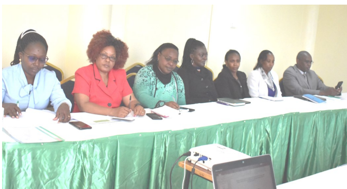
A section of the participants