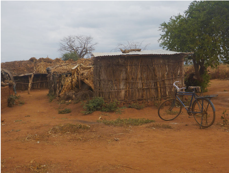
FIG. 3—Impoverished settlement near a park boundary. [Color figure can be viewed at wileyonlinelibrary.com ]

Although biased by racist and colonial attitudes, the travel accounts and ethnographies of the earliest Europeans to visit the Tsavo region can, with caution, provide vivid descriptions of people, elephants, and landscapes (Krapf 1860; Hobley 1895; Corfield 1974).