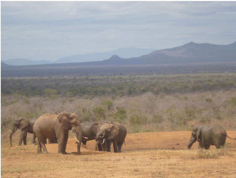
FIG. 2—Landscape with elephants in foreground and inselbergs in background. (Source: Photograph by the authors, June 2015). [Color figure can be viewed at wileyonlinelibrary.com ]

Low elevation plains punctuated by inselbergs—steep, isolated hills—characterize Tsavo (Figure 2). Savannah covers the lowland plains, with open grassland in some zones but mainly a patchy mixture of grassland, shrubland, and open woodland dominated by thorny, drought-tolerant acacia and myrrh species ( Acacia spp., Commiphora spp.). Compared to the plains, the hills have higher precipitation and deeper, more fertile soils that support montane