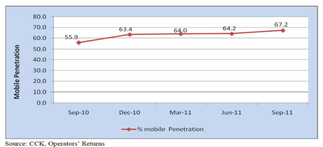
Figure 1.1 Kenyan Mobile Penetration Rate, CCK Quarter 1 2011/2012

Even with these acknowledgeable strides key among the problems in Kenya's ICT development is the wide digital divide between rural and urban areas, with the latter having more access to these facilities? The problem lies in the fact that over 50% of this country's population resides within rural areas indicating the large economic potential of these areas (Kenya Economic Update, 2010). There have been numerous problems within rural areas such as poor transport network, limited access and the cost to the last mile that are resulting in a slower reach of ICT to these communities. As compared to urban areas, where Internet access is readily available and cheaper to access, it is considerably more expensive to obtain the same services in a rural area.