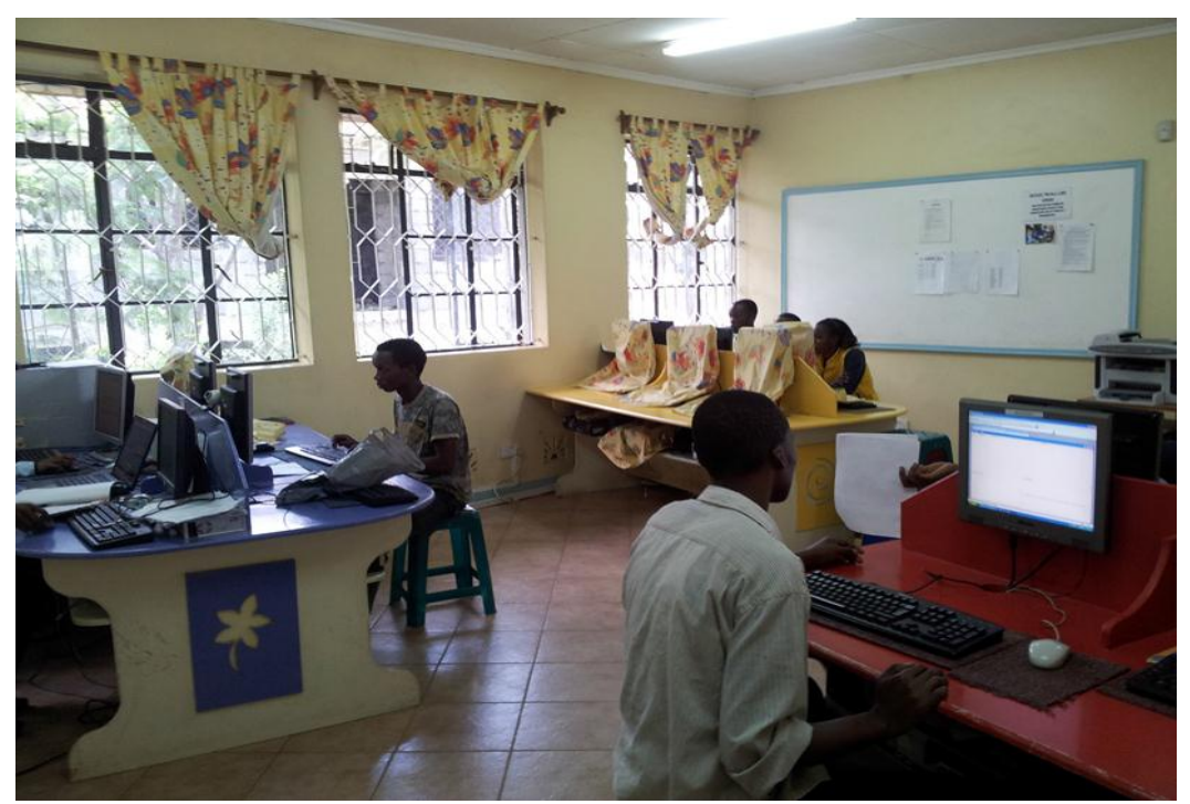
Figure 1.3: The Settings of Mukuru (the picture is representative of many deprived environs in Kenya) and Mukuru Promotion Centre

If these are achieved, the digital villages will function effectively and serve as effective agents for community to have access to knowledge and achieve desirable outcomes. However it has been observed that lack of constant power supply, and affordable and stable connectivity as well as difficulties in maintaining the digital villages equipment's are the most common problems affecting telecentres success (Fillip and Foote, 2007).